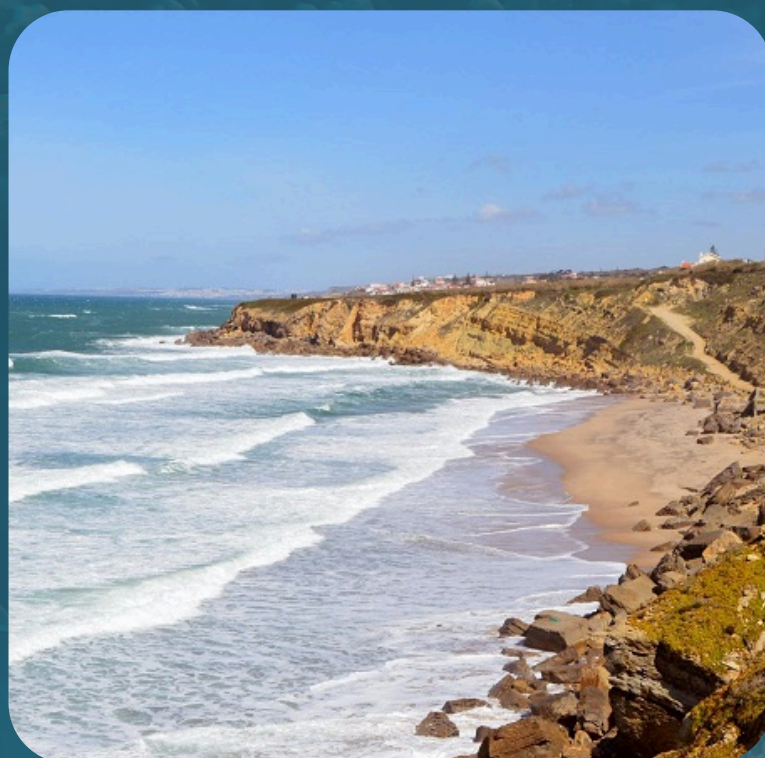
Praia da Aguda

Aguda, in Vila Nova de Gaia, is a fishing village that has also become a tourist destination, it is known for its clean, long beach, small, traditional fishing port, and the Aguda Aquarium, which celebrates the sea and wildlife.