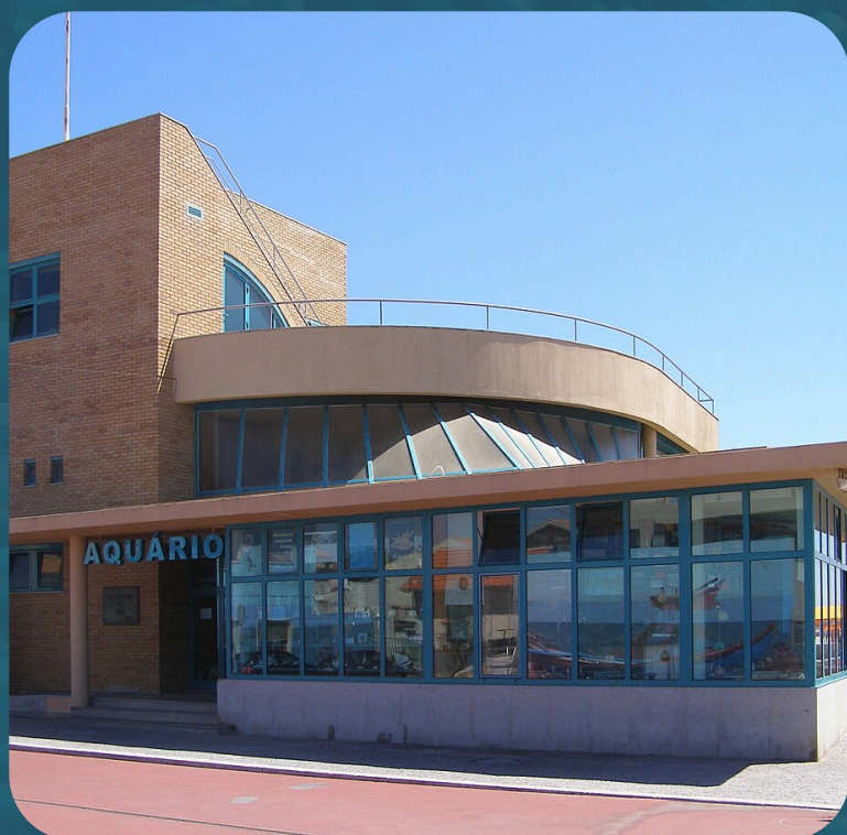
Estação litoral da Aguda